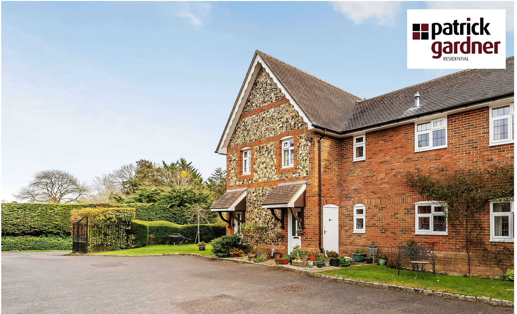
6 Marlborough Court The Marld, Ashted, Surrey, KT21 1RY